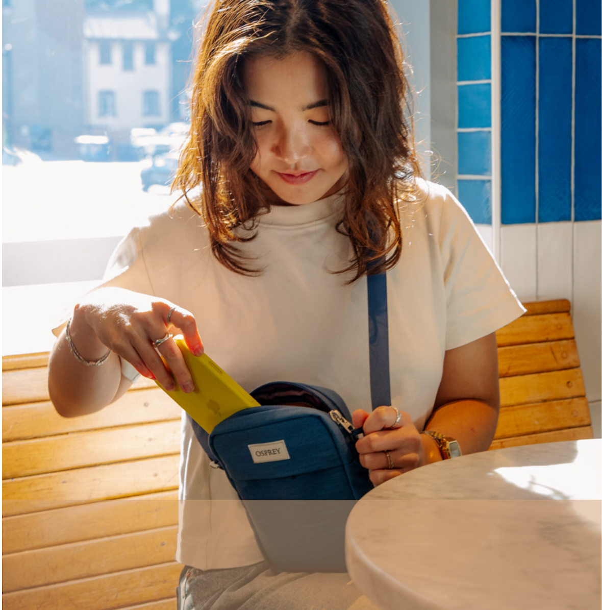
All products styles and colours subject to availability.

Our curated collection of premium merchandise is crafted with durability, design and purpose in mind. We believe that great products should do more than just look good. They should be made to last, with quality materials and timeless design that stand up to everyday use and reflect true value over time. Our product selection is built for longevity – the kind of merchandise people reach for often and use again and again.